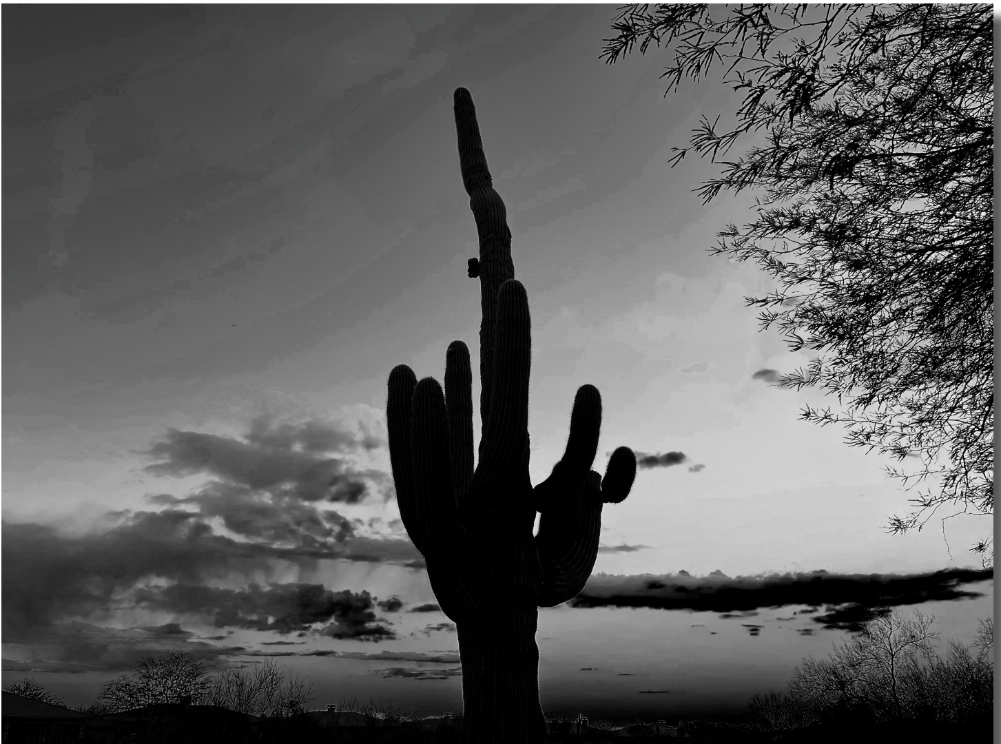
Arizona Sunset

It has come to the Board's attention that some of our homeowners and/or their guests are parking their cars and trucks around the cul-de-sac at the north end of Balao Drive adjacent to our new Lone Mountain trailhead. Such parking is a violation of the Scottsdale Fire Code (parking is not allowed on any cul-de-sac in Bellasera) and is disrespectful to our residents who live nearby.