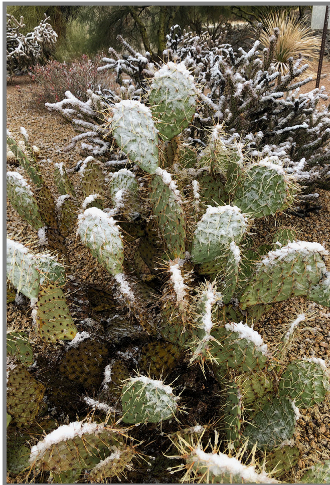
Cactus with snow - January 26, 2021

Effective February 1 all new or renewal classified ads must be 75 words or less. Ads will run for 3 months and may be renewed upon request. E-mail your ad to: editor@azbellasera.org .