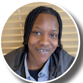
Keyera - weekends