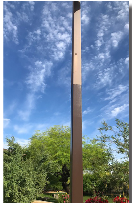
Before and after painting

This is again another example of the effort of the Board to continue the maintenance of the community as it ages. It is sometimes easy for us to forget that it is the responsibility of the community to provide all the maintenance to the roads, signs, clubhouse, recreation areas and open space. The Board will continue with these efforts.