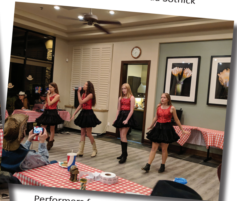
Performers from the Scottsdale Music Conservatory