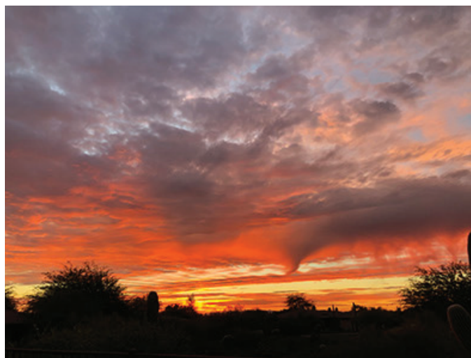
Arizona sunset - December 16, 2018